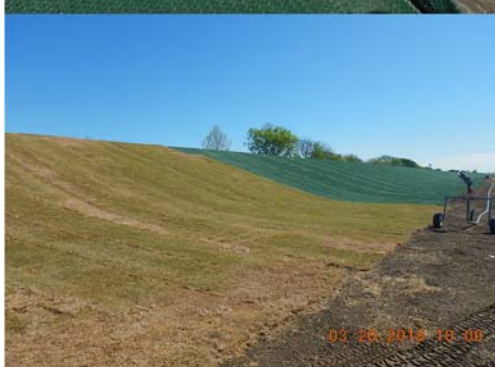
Sod and HPTRM on LPV-ARM-10 (right)