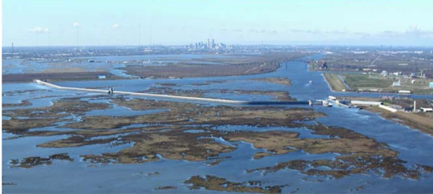
Surge Barrier Crossing the IHNC and GIWW