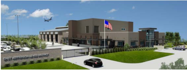
Depiction of new EJLD Safehouse & Consolidated Facility

The 27,000 square foot complex current under construction at 11000 Reverent Richard Wilson Drive in Kenner will bring all East Jefferson Levee District (ELJD) operations into one facility. The building will include a safe room, built to withstand 200 mph winds, office space for administrative, maintenance and police personnel, and a 11,000 square foot maintenance shop. The police will occupy the