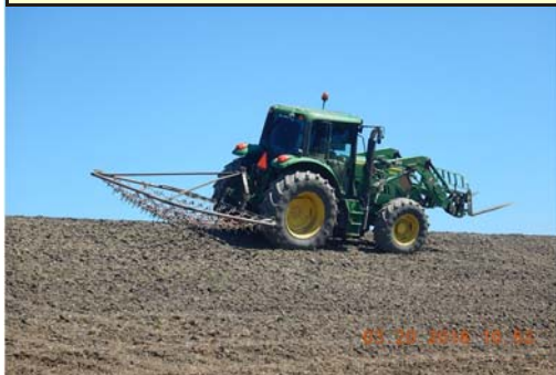
Ground preparation is done by tiller or saw tooth harrow (left)

**New Orleans East – Armoring and Levee Lift