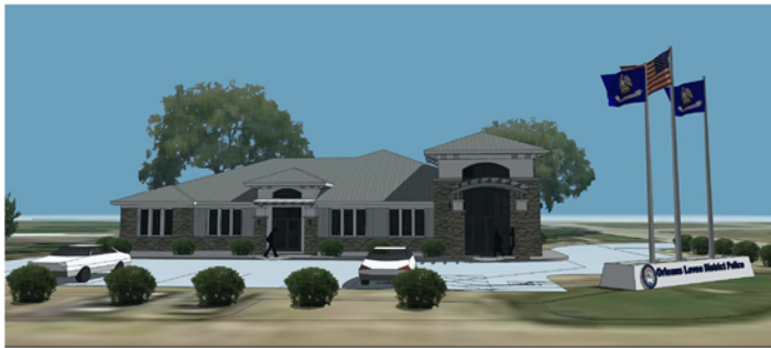
Depiction of O.L.D. Complex

The new state of the art Police Complex being constructed at the intersection of Elysian Fields Avenue and Lakeshore Drive in New Orleans includes dispatch/communications facilities, training room, holding cell, locker rooms and breakroom. The easily accessible and strategically located Elysian Fields site has historically served the Orleans Levee District (O.L.D.) Police Department and the public well. The site will be secured with fencing and will have a storage garage for police vehicles.