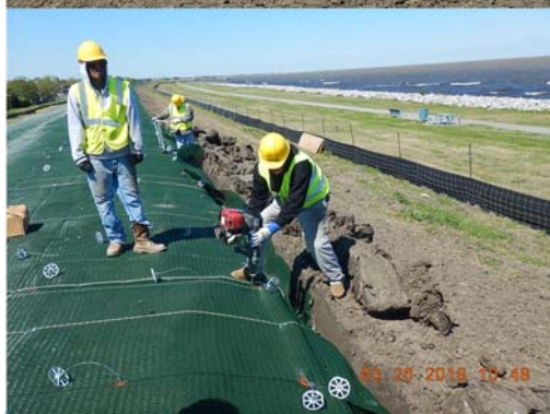
Anchors are installed on flood side at trench (left)