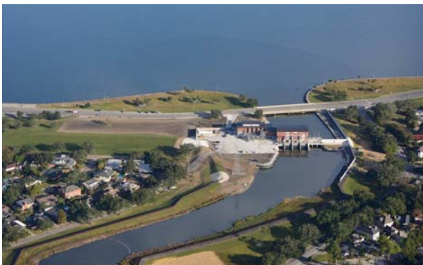
Orleans Avenue Canal

The notice to proceed with construction of the project was issued on May 6, 2013. Construction of the project was completed in December, 2017, at a total cost of $615 million. [After testing the pumps and inspection of the project, the PCCP will be turned over by the Corps to the Coastal Protection and Restoration Authority (CPRA), the Non-federal Sponsor for the HSDRRS.] The CPRA, Flood Protection Authority and S&WB entered into a Cooperative Endeavor Agreement (CEA) on February 1, 2018, which designates the Flood Protection Authority as the entity responsible for the operation, maintenance, repair, repair and rehabilitation (OMRRR) responsibilities for the PCCP. The CEA provides that the S&WB pay 50% of the OMRRR cost. The initial estimate of the annual OMRRR cost is $4 million. The S&WB will share real time monitoring data for the pump stations that pump water into or through the outfall canals so that the Flood Protection Authority can monitor conditions in real time.