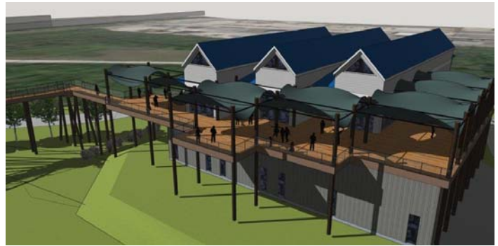
Depiction of proposed Visitor's Center (above & left)

The Surge Barrier is one of the largest storm surge barriers in the world. It is nearly two miles long and stretches across open water and marsh in eastern New Orleans and St. Bernard Parish. The mammoth structure includes three navigational flood gates to allow marine vessels access through the barrier at the Gulf Intracoastal Waterway and Bayou Bienvenue. It was designed and built at a cost of $1.2 billion by the U.S. Army Corps of Engineers after New Orleans and its surrounding areas were devastated by the storm surge accompanying Hurricane Katrina in August of 2005.