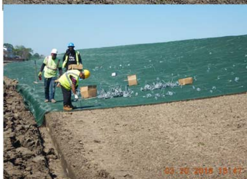
Installation on protected side at trench (right)