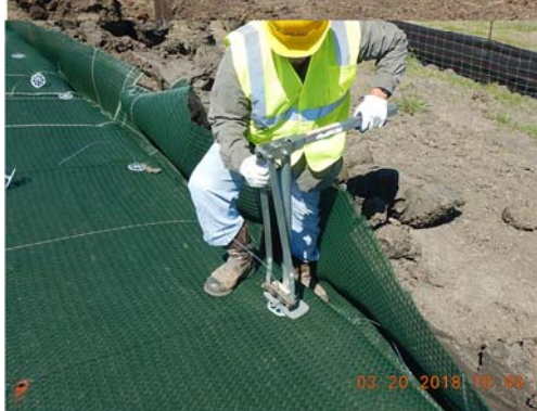
Anchors are pulled tight (right)