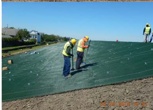
Pins being installed (left)