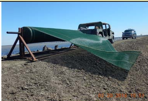
HPTRM on roll before installation (right)