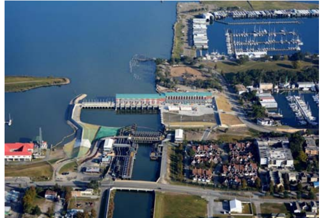
17th Street Canal

In the aftermath of Hurricane Katrina, the U.S. Army Corps of Engineers (Corps) constructed Interim Closures with temporary pumps at the mouths of the 17th Street, Orleans Avenue and London Avenue Outfall Canals to prevent storm surge from Lake Pontchartrain during a tropical event from entering the canals, thereby reducing the risk of a failure along the canals. The Corps' intent was to follow this temporary measure with the construction of a permanent, more sustainable solution.