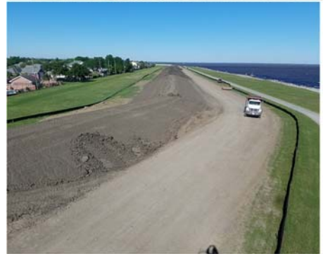
LPV 0.02 Levee Lift - 2017

The Flood Protection Authority surveyed levee elevations in 2014 and determined that by the end of 2016 some segments would fall below the necessary elevation to provide the authorized level of protection.