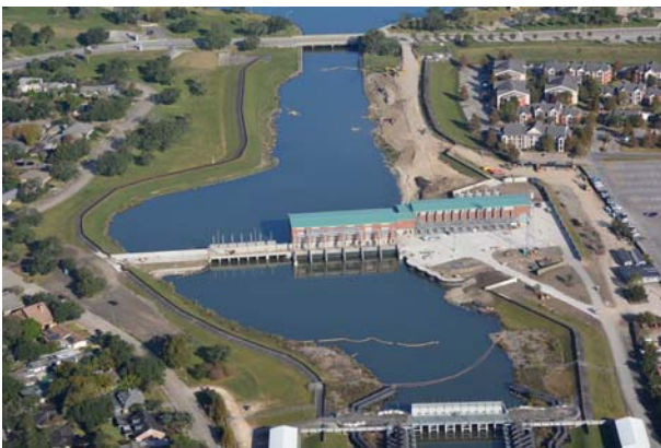
London Avenue Canal

The PCCP, located at or near the mouth of each outfall canal, consists of permanent gated storm surge barriers that are closed in advance of a tropical storm event when Lake Pontchartrain stages are elevated, and pump stations to move rainwater out of the canals, past the gates and into Lake Pontchartrain while the barriers are closed. The PCCP pumps cannot drain city streets directly, and only operate when the PCCP bypass gates are closed due to tropical events and the Sewerage and Water Board (S&WB) pump stations are pumping rainwater into the canals.