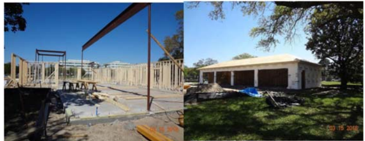
Complex and Garage Building as of 3/14/18

Architect: RCL Architecture, LLC Contractor: C.M. Combs Construction, LLC Contract Period: 300 consecutive calendar days Notice to Proceed: October 30, 2017 Completion date: September 14, 2018 Square footage: 10,000 square feet Construction Cost: $2,950,000