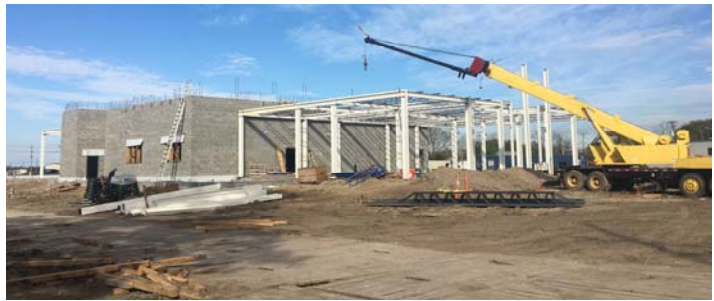
Complex Construction as of 3/2/18

Architect: Sizeler Thompson Brown Architects Contractor: Lamar Contractors Contract Period: 435 consecutive calendar days Notice to Proceed: August 14, 12017 Completion date: December, 2018 Square footage: 27,000 square feet Construction Cost: $10,532,525