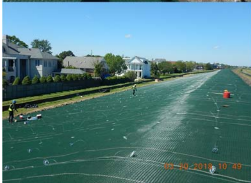
Installed HPTRM on ARM-07 (left)