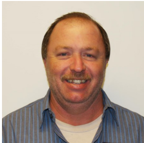
Kent Ural Maintenance Superintendent Orleans - 12/16/2019