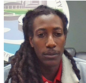
Ashton Green Mobile Equipment Operator 1 Orleans - 12/16/19