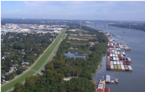
Mississippi River Levee

The Mississippi River & Tributaries (MR&T) project was authorized by the 1928 Flood Control Act. Since its inception, the MR&T program has brought an unprecedented degree of protection against riverine flooding. Levees are the backbone of the MR&T project flood control plan.