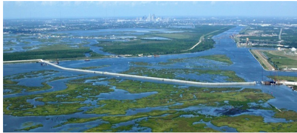
IHNC-Lake Borgne Surge Barrier

More than 1 million citizens are better protected from hurricane-driven flooding today than ever before. The $14.6 billion HSDRRS is comprised of numerous features including levees, floodwalls, floodgates, surge barriers and pump stations, and provides defense against a 100-year storm surge for the citizens of southeast Louisiana, including Orleans, Jefferson and St. Bernard Parishes.