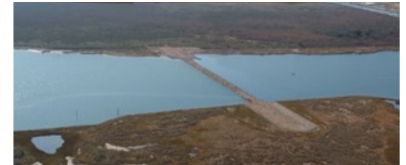
MR-GO Rock Dam Channel Closure

A higher level of hurricane and flood protection beyond the 100-year level is achievable through construction and reinforcement of stronger, sustainable levees, floodwalls, floodgates and pumps, as well as advancement of long-term coastal protection and restoration. The Flood Protection Authority will work to secure the future of the Pontchartrain Basin, re-establish self-sustained habitats and enhance storm protection.