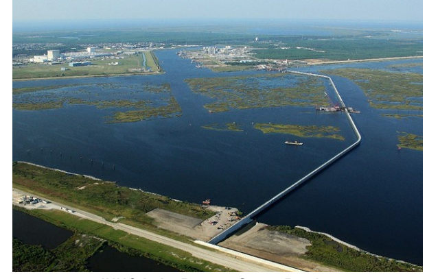
IHNC-Lake Borgne Surge Barrier

The HSDRRS includes eight Complex Structures (Navigation Gates): IHNC Surge Barrier Sector Gate and Barge Gate, Bayou Bienvenue Vertical Lift Gate, Bayou Bienvenue Sector Gate, Bayou Dupre Sector Gate, Caernarvon Sector Gate, Seabrook Sector Gate and Bayou St. John Sector Gate.