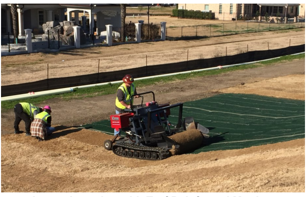
Levee Armoring with Turf Reinforced Matting

The Flood Defense System includes 191 miles of federal and non-federal levees and floodwalls (3,500+ acres of levee). The HSDRRS project included raising floodwalls and levees and in some areas levees were widened. Resiliency was added to lessen the effects of overtopping (armoring) through the installation of turf reinforced matting, concrete slabs or rip-rap. Subsidence and sea level rise will necessitate levee lifts in the future to maintain the 100-year level of protection.